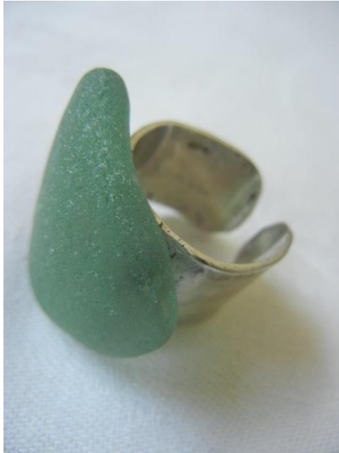
Ring sterling silver - glass