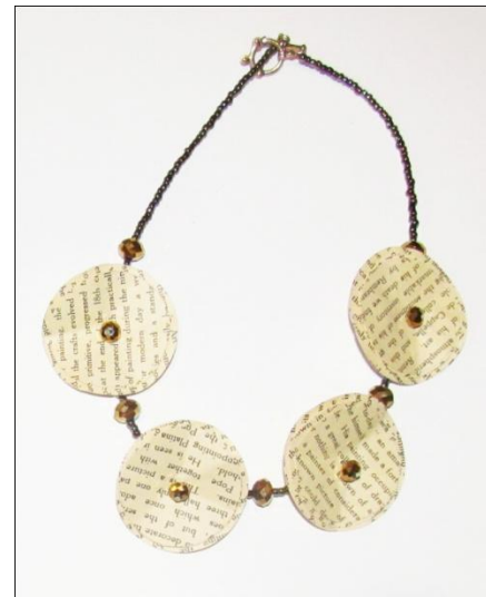
Necklace mix media