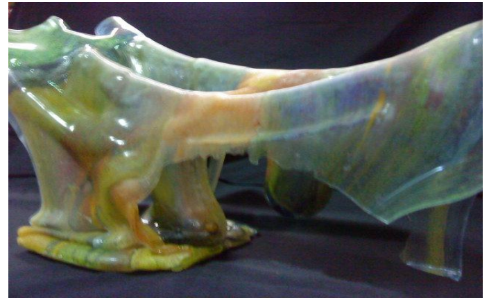
"In tension" Glass