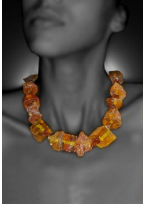
Resin beads neck lace