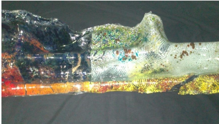
"Third Space" Glass Sculpture