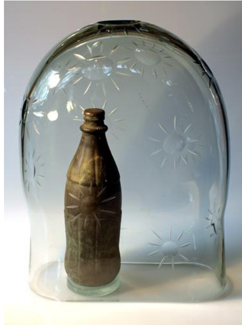
"I-Still-Remember-When..." Glass Sculpture