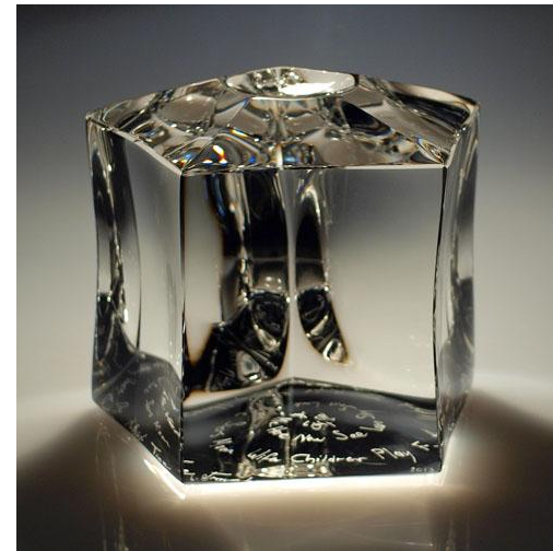
"Lantern" Glass sculpture