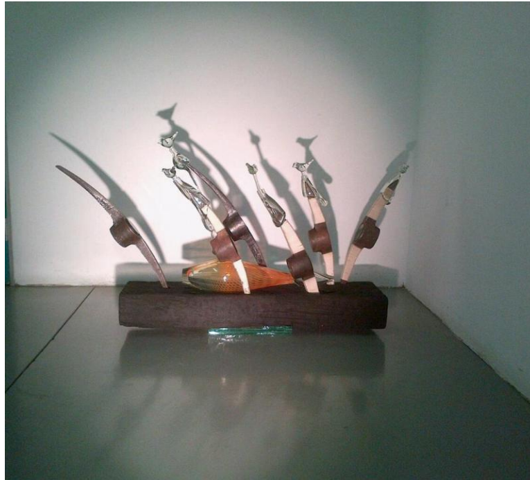
Labour Abuse Mix Media