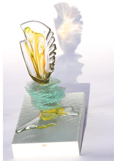
Untilled 49.6 * 23.6 Mixed medium