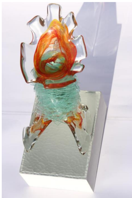
Growth 60.2 x 21.7 Mixed media