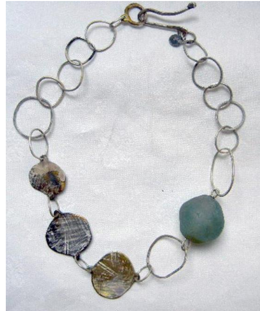
Necklace sterling silver glass bead