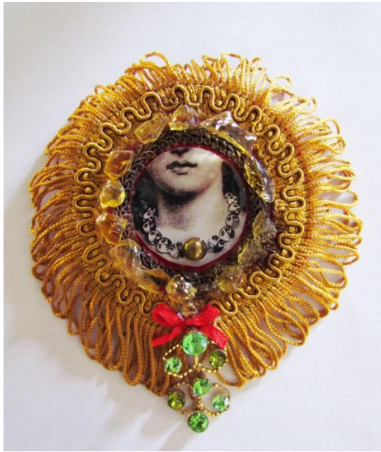
Brooch mix media